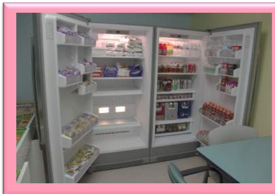
The commercial size fridge and freezer are almost completely packed too!

CHILDREN'S HOSPITAL CENTRAL CALIFORNIA MAIN ENTRANCE THE GUILD HALL